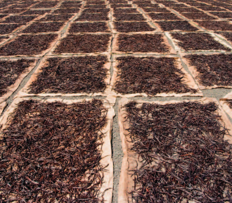
Vanilla pods drying in the sun in Madagascar. Synthetic biology companies are now producing vanillin from glucose.

uses are on the horizon that may well challenge the way in which the use of genetic resources is currently understood. The intersection of nanotechnology and biology, for example, is allowing scientists to imagine and create biological systems as the inspirations for technologies not yet created - with profound implications for a range of sectors, and for society at large. The use of microorganisms to synthesise functional nanoparticles is also receiving increased interest. What this means for ABS is still uncertain, but what is clear is that new regulatory approaches will need to be developed as these technologies unfold.