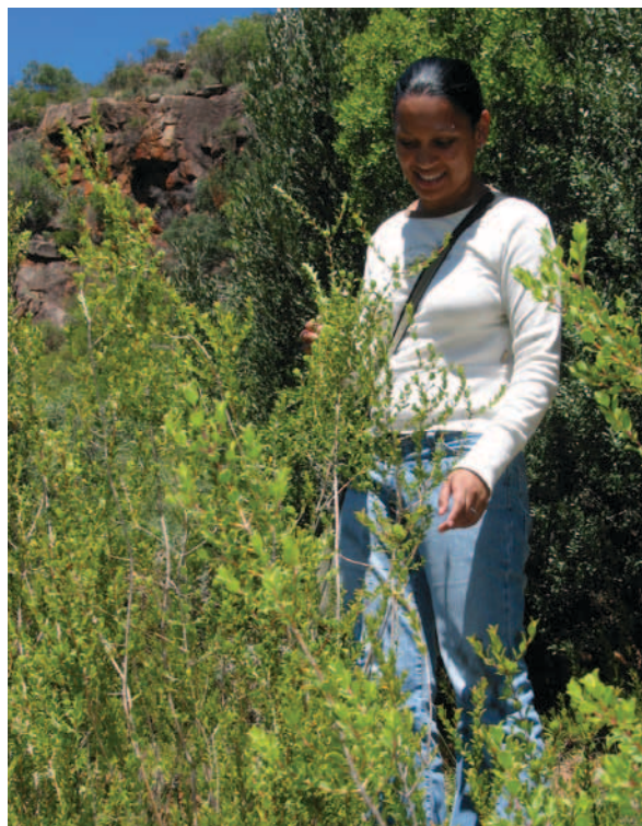
Buchu ( Agathosma spp), native to southern Africa, is an important flavourant in the food and beverage industry.

Proteins are of particular interest for sports drinks and meal replacements, to help build muscle mass, aid in weight loss, and combat ageing. Vegan and allergen-free sports products are gaining market share, including protein blends of hemp, sprouted brown rice, peas and grasses. The price of whey, a standard protein source, is volatile and so alternative plant sources of protein are also of interest to manufacturers and formulators. 10 The functional beverage market,