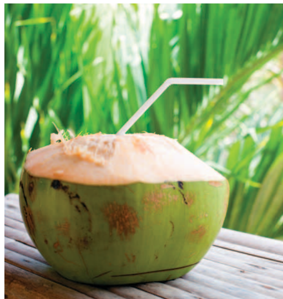
New molecular developments are investigating traditional varieties for improved taste, flavour and climate adaptation.

– The monitoring of ingredients incorporated into food and beverage products presents significant challenges due to the multiple ingredients and product lines that are involved across several sectors. Through the checkpoints described in Article 17, the internationally recognized certificate of compliance, and the ABS Clearing-House, the Nagoya Protocol can help to monitor the use of genetic resources throughout supply chains and provide evidence that prior informed consent has been obtained, that mutually agreed terms have been negotiated, and that benefits are have been shared.