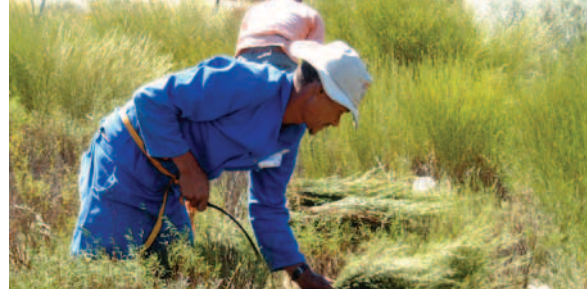
Harvesting rooibos ( Aspalathus linearis ) in South Africa. Although traditionally used as a tea, increased R&D is leading to the incorporation of rooibos in the functional foods and cosmetics industries.

As markets and technologies have developed, and consumer choices have become more sophisticated,