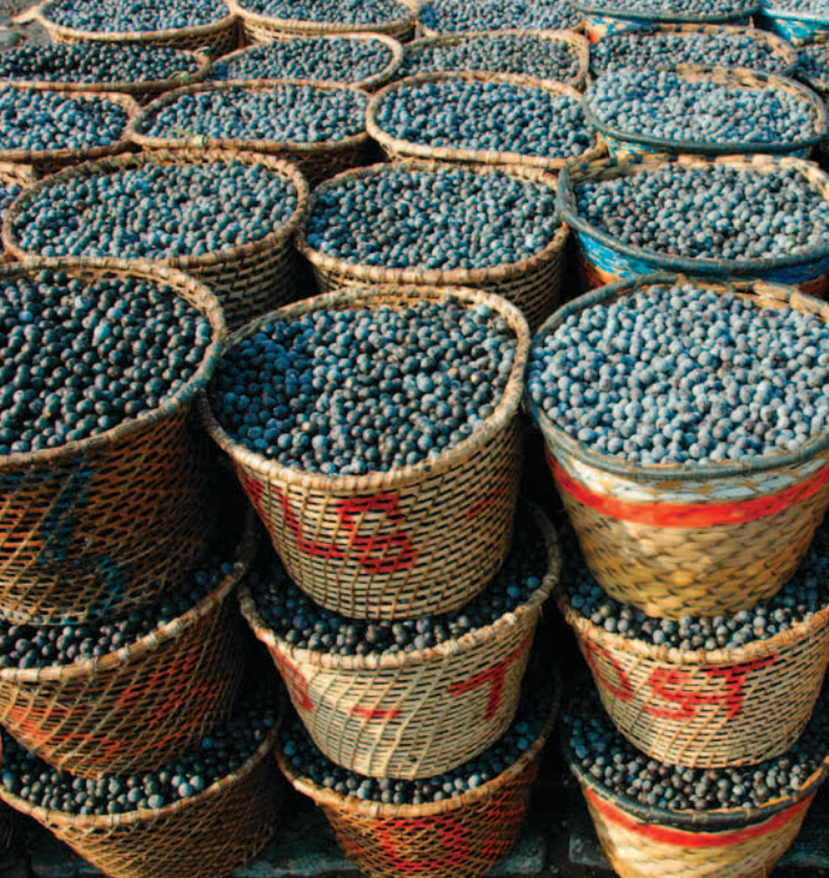
Labelled "superfruit" due to their high level of anti-oxidants, açai berries are made into wine in the Brazilian Amazon.