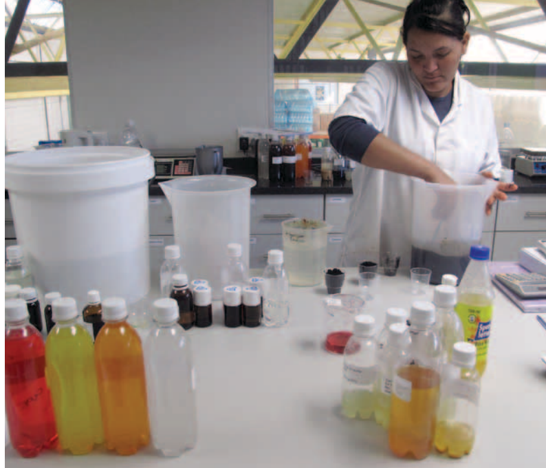
Larger food and beverage companies have in-house capacity to pursue R&D.

Processing techniques may also increasingly use genetic resources, especially with increased demand for natural preservatives. The company Aquapharm Biodiscovery, for example, has identified a range of ingredients mined from the world's oceans that have anti-bacterial ingredients, including bacteriocins, so-called friendly bacteria that neutralise pathogens. 46