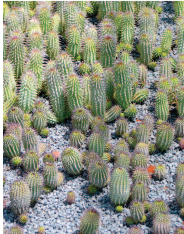
Young cultivated Hoodia gordonnii plants. The stems have appetite suppressing properties, developed based on the traditional knowledge of the indigenous San.

Providing legal certainty, clear and workable regulations and effective and streamlined measures – Difficult, time-consuming and bureaucratic regulations and permitting procedures, and an absence of legal certainty when acquiring genetic resources from some countries, are regarded by many companies as major stumbling blocks in research to develop innovative food and beverage products. The Nagoya Protocol seeks to address these concerns and create an environment of legal certainty and mutual trust by requiring Parties to designate a national ABS focal point to make information available on procedures for