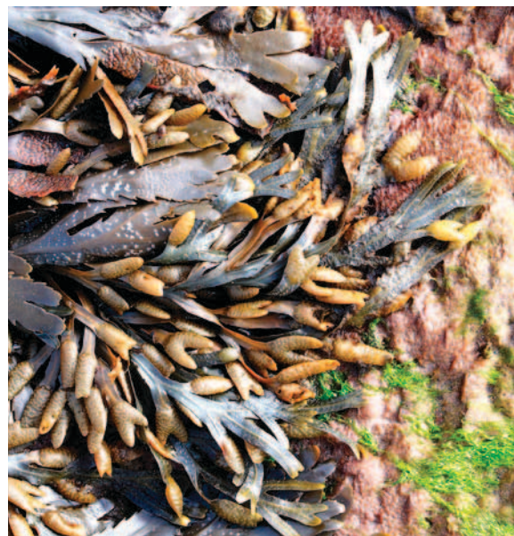
There is increasing interest in the new functional food ingredients from marine algae.

A range of environmental and social certification systems and standards has been developed in the food and beverage sector, some emphasising the way ingredients are produced and supplied and others guaranteeing the quality and safety of the product. “Certified environ-