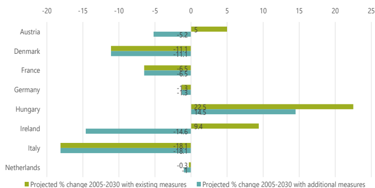
Figure 2: Projected percentage changes in agricultural emissions (2005-2030)